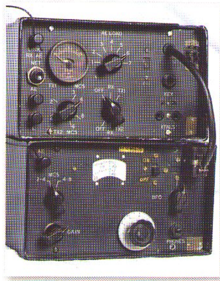
Fig. 4: The Mk128 transmitter (top) and receiver.

62 Cobden Street Kidderminster Worcestershire DY11 6RP E-mail: military1944@aol.com