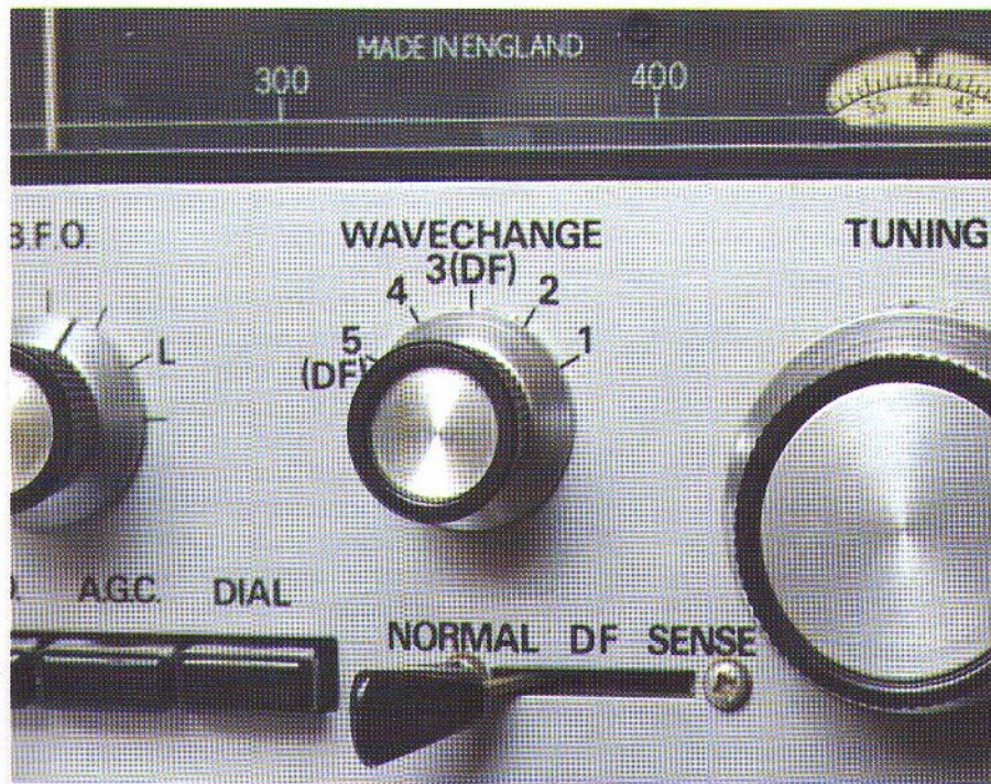
Fig. 6: The Direction Finding control.

Well that's about it for this stint at the V&V 'shop'. I hope you have enjoyed the selection I have bought you and there are more pictures at www.qsl.net/g4bxd As always I can be contacted at my E-mail address: military1944@aol.com Cheerio for now!